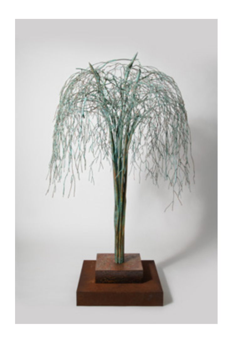
LEFT: Denese Oates, Sugarloaf Tree, 2020, copper on corten steel plinth