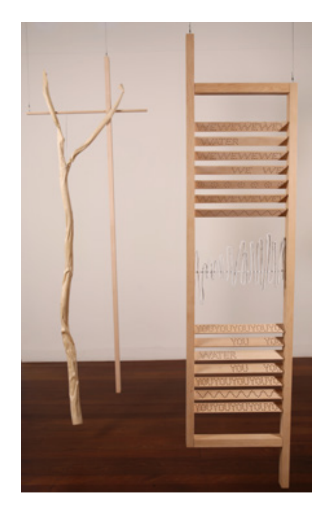
LEFT: Cathe Stack, Changing Line of Coastline Series 1 (detail), 2019, Australian timbers; Silver Ash and Celery Top, stoneware with carbon burn, string and salt paint