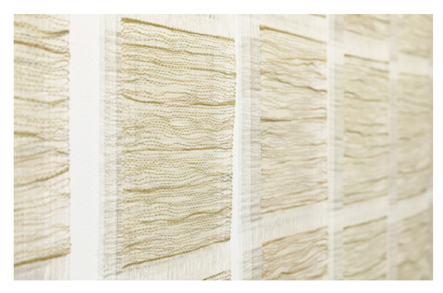
ABOVE: Sairi Yoshizawa, in distance (detail), 2020, natural dyed hand woven wool and cotton