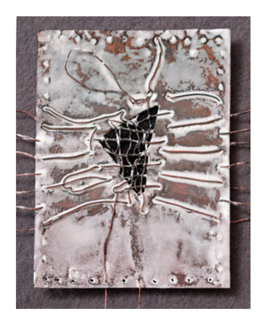
LEFT: Sally Aplin, Patches of Stitching (a series), 2020, vitreous enamel on copper