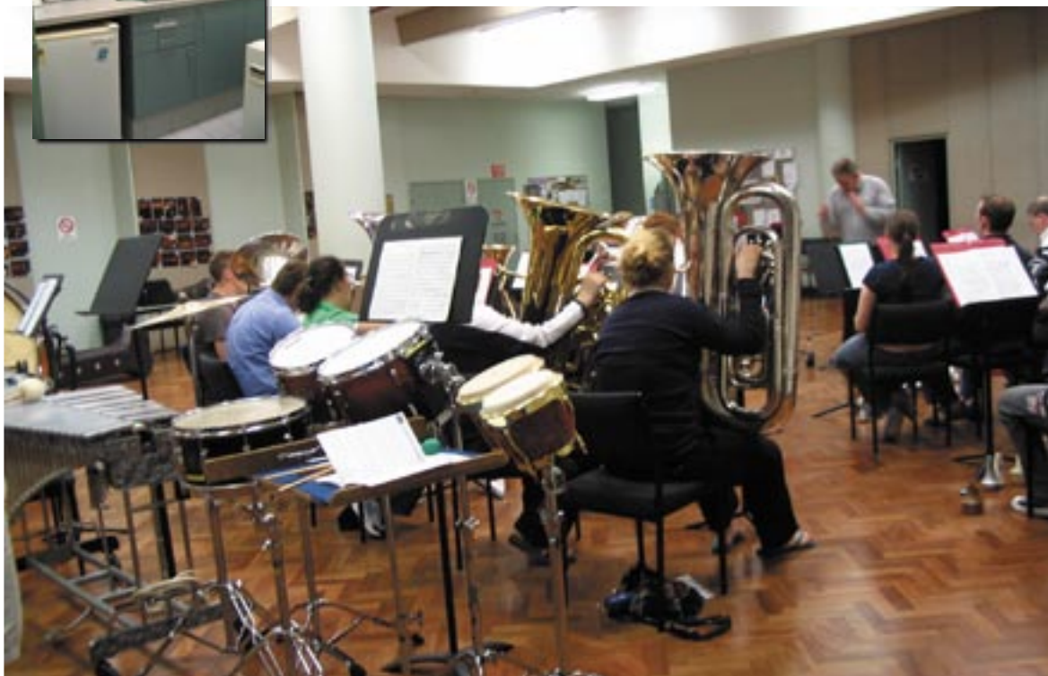
Willoughby Band rehearsal

Please contact the Performing Arts Unit on 9777 7555 to discuss a venue and service package that suits you and related pricing.