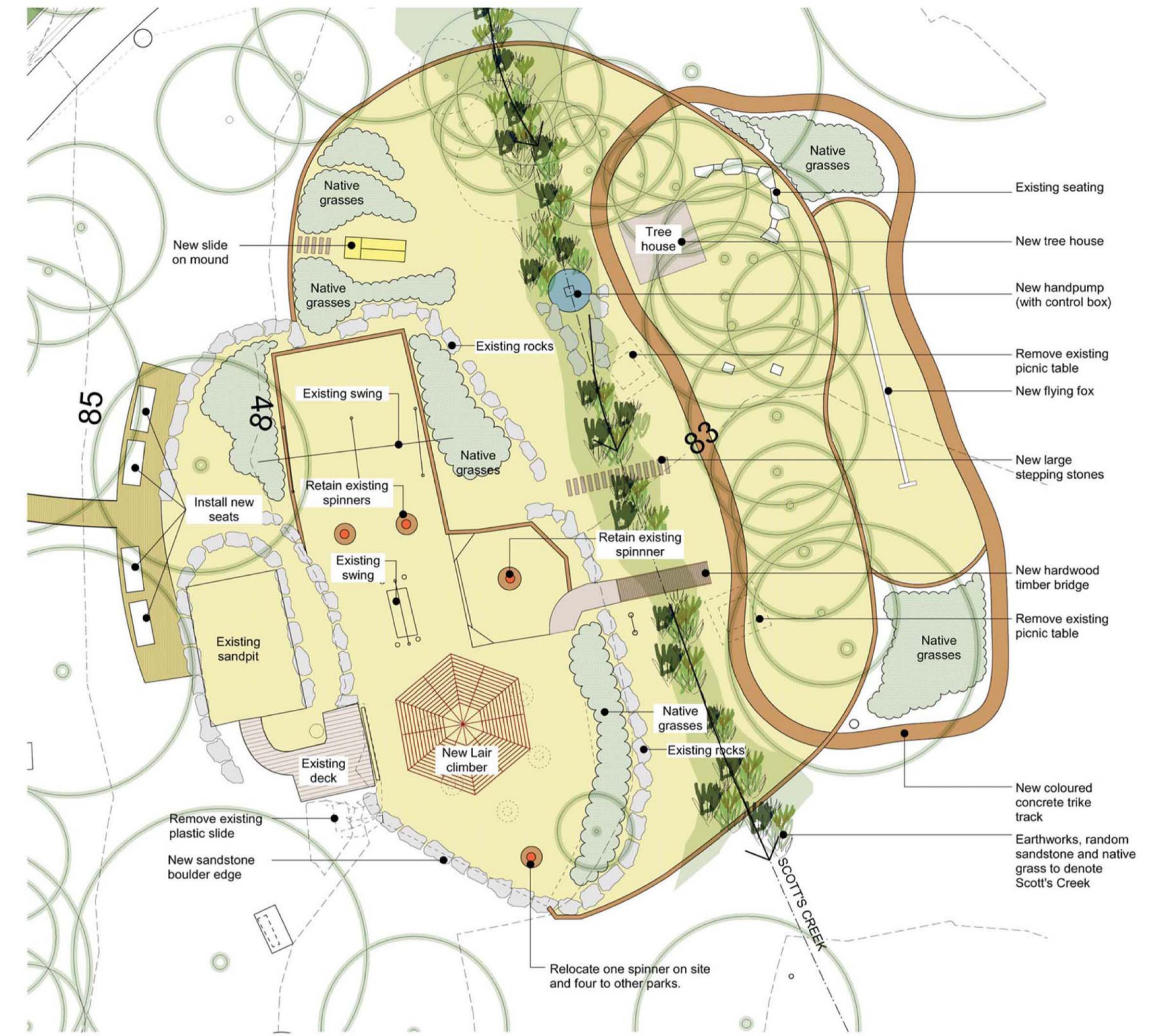
CHILDRENS PLAYGROUND: SUBJECT TO FURTHER CONSULTATION WITH USERS 1:200 @ A1