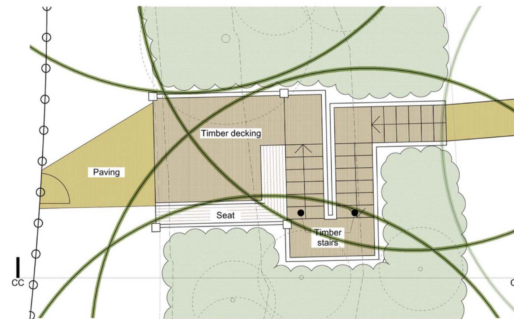
ACCESS STAIRS 1:50 @ A1