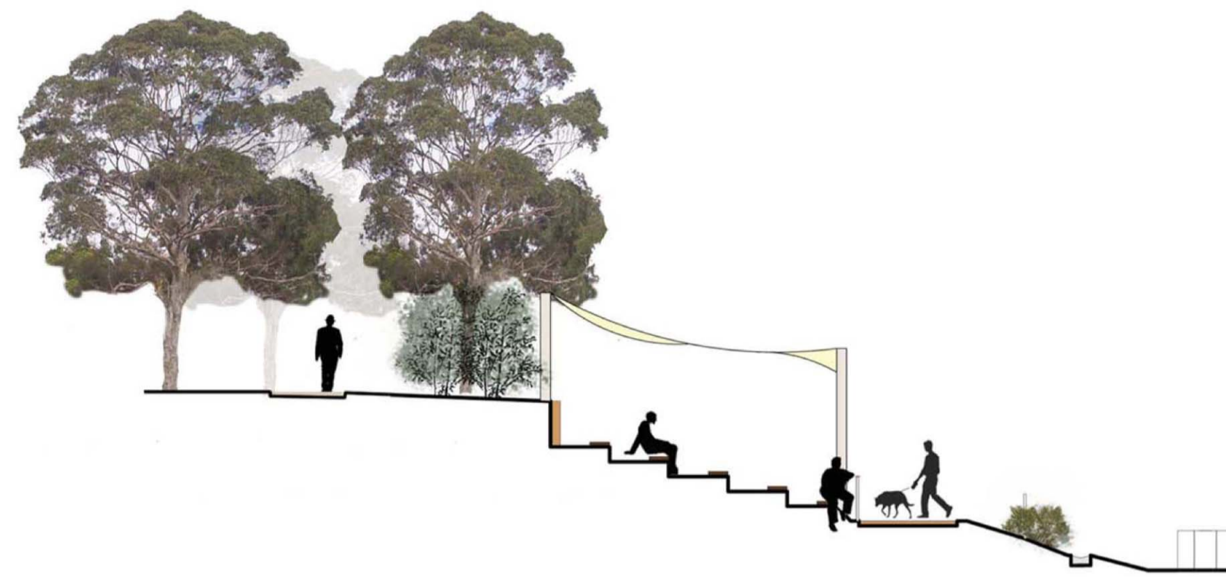
SECTION AA: PROPOSED SPECTATOR SEATING 1:100 @ A1