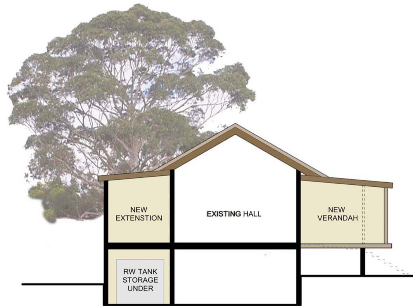
SECTION BB: PROPOSED PAVILION ALTERATIONS 1:100 @ A1