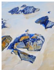
3. Sunglazed rocks, Cabarita Beach NSW , 2021 Oil on canvas 76 x 101 cm $2,500