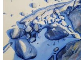
6. Bluegold , 2021 Oil on canvas 101 x 76 cm $2,500