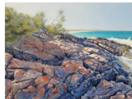
8. Afternoon light, Cabarita Beach NSW , 2021 Oil on canvas 101 x 76 cm $2,500