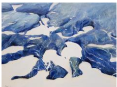
13. Blueschist, 2021 Oil on canvas 101 x 76 cm $2,500