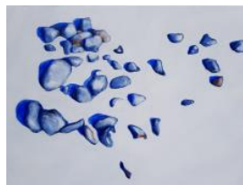
9. Rocks in space , 2021 medium 101 x 76 cm $2,500