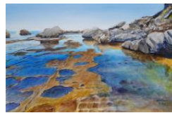
16. Rock platform, Forresters Beach NSW, 2021 Oil on canvas 101 x 66 cm $2,500