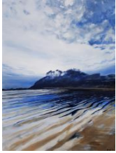
1. Woopi sunset , 2021 Oil on canvas 76 x 101 cm $2,500