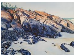
5. Sunlit rocks, Cabarita Beach NSW , 2021 Oil on canvas 101 x 76 cm $2,500