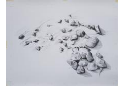
15. Pencil pebbles, 2021 Pencil on paper 56 x 42 cm $900