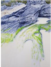
2. Rottnest seagrass , 2021 Oil on canvas 76 x 101 cm $2,500