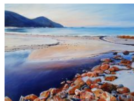
10. Elizabeth Beach NSW , 2021 medium 101 x 76 cm $2,500