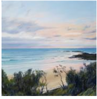
11. Diggers Camp sunset , 2021 medium 76 x 76 cm $2,200