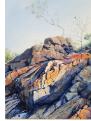
14. Glance of sunlight, Cabarita Beach NSW, 2020 Oil on canvas 76 x 101 cm $2,500