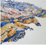
12. Blue veins, Diggers Camp NSW, 2021 Oil and ink on canvas 76 x 76 cm $2,200