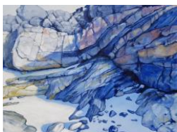
4. Deep shade, Cabarita Beach NSW , 2020 Oil on canvas 101 x 76 cm $2,500