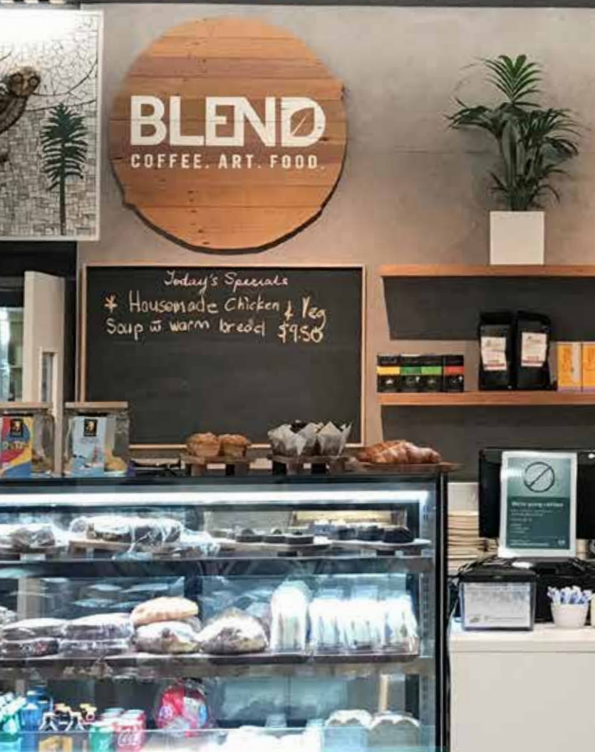
Table bookings: 9777 7820 Foodcc@willoughby.nsw.gov.au